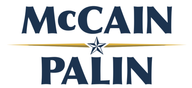
Figure 3. John McCain's campaign logo for the 2008 American presidential election, set in Optima.