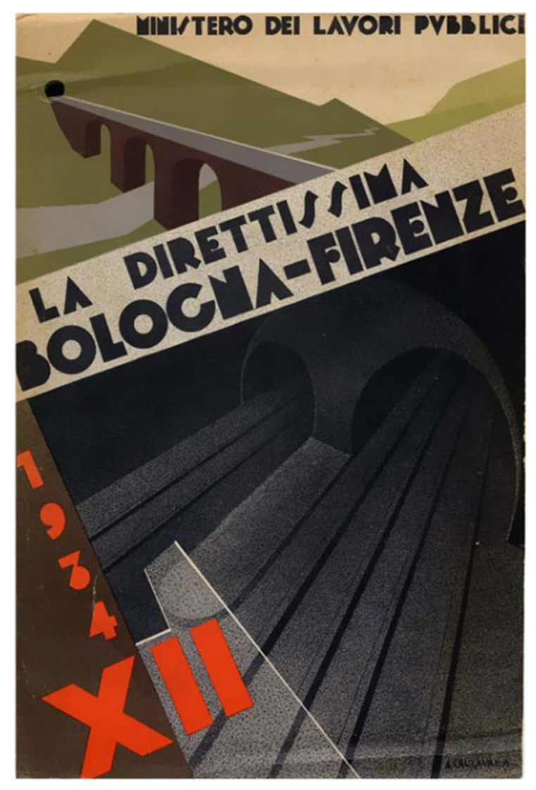
Figure 9. Cover of La Direttissima Bolgona-Firenze 1934-XII (1934), designed by Attilio Calzavara.

Even absent associations with national identities, though, typography can communicate political ideology, particularly in relation to its attitudes toward labor and markets. As a prime example, Jan Tschichold's 1928 manual for designers, Die neue Typographie ( The New Typography ), is in essence a political manifesto, a manifesto for an inherently socialist design (see Tschichold, 1995). His ideals of typography encapsulate socialist ideology at every turn, from his espousal of a collective style with no personally distinguishable characteristics—a product of the anonymous laborer—to his emphasis on work and the means of production. Indeed, the entire creative output of the Bauhaus, of which Tschichold was a