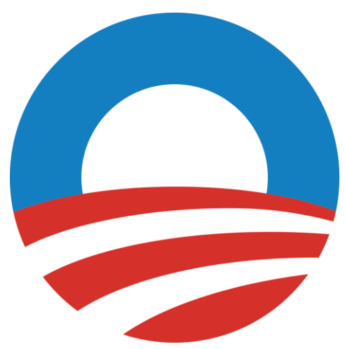
Figure 1. Barack Obama's campaign logo, designed by Sol Sender for the 2008 American presidential election.